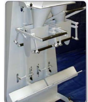
Easy to use twin grip bag clamps and adjustable height sack supports.