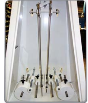
Mechanical workings of the Simplafill Mini 2000